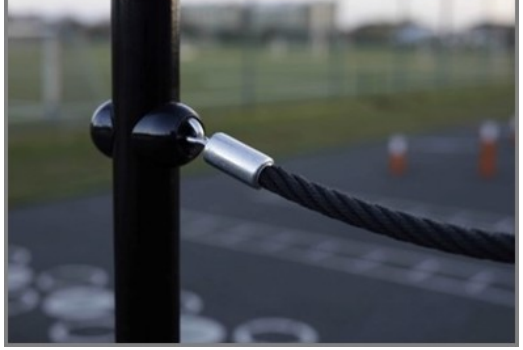
Ropes are made of UV-stabilised PES with inner steel cable reinforcement. The rope is induction treated in order to create a strong connection between steel and rope which leads to good wear resistance.