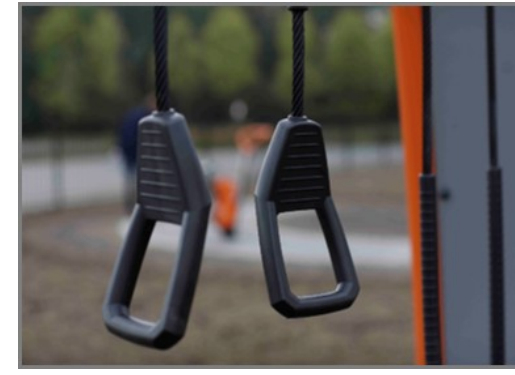
The uniquely designed handles are made of PUR and a reinforced aluminium frame that ensures a strong but light design. The ergonomically shaped handles guarantee a good and pleasant grip for all users.

The Sign is made from a 15mm Polycarbonate and supported by Ø38.2mm top bar. This is an extremely solid assembly which provides great structural stability. The sign shows the 11 main exercises and has a QR code which refers users to the Kompan Fit APP that offers extended support on exercises and training.