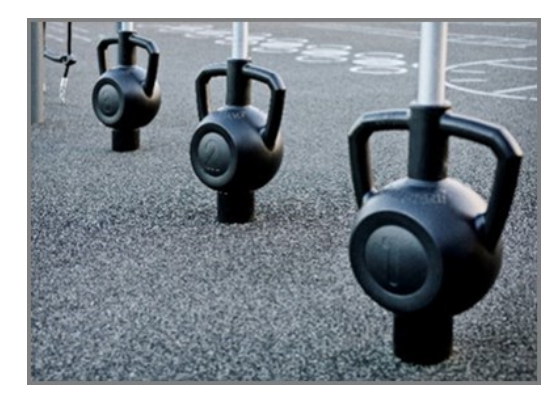
The uniquely designed Magnetic Bells are made of PUR and a reinforced aluminium steel frame that ensures a strong design. The ergonomically shaped handles guarantee a good and pleasant grip for all users.